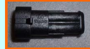
TYCO/AMP P/N 282104-1

*** WIRE SEAL IS REQUIRED FOR ALL CONFIGURATIONS *** RECEPTACLE CONTACT AND WIRE SEAL SELECTION FOR P/N 282080-1