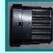
TYCO/AMP P/N 282108-1

*** WIRE SEAL IS REQUIRED FOR ALL CONFIGURATIONS *** RECEPTACLE CONTACT AND WIRE SEAL SELECTION FOR P/N 282090-1