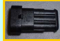
TYCO/AMP P/N 282105-1

*** WIRE SEAL IS REQUIRED FOR ALL CONFIGURATIONS *** RECEPTACLE CONTACT AND WIRE SEAL SELECTION FOR P/N 282087-1