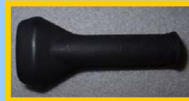
TYCO/AMP P/N 880811-2

OPTIONAL 3 POS RUBBER BOOT FITS BOTH PLUGS AND CAPS