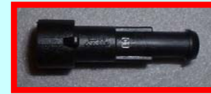
TYCO/AMP P/N 282103-1

*** WIRE SEAL IS REQUIRED FOR ALL CONFIGURATIONS *** RECEPTACLE CONTACT AND WIRE SEAL SELECTION FOR P/N 282079-2