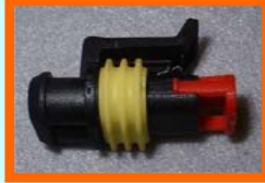
TYCO/AMP P/N 282080-1