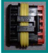
TYCO/AMP P/N 282090-1