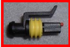
TYCO/AMP P/N 282079-2