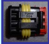
TYCO/AMP P/N 282088-1