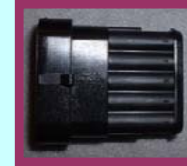
TYCO/AMP P/N 282107-1

*** WIRE SEAL IS REQUIRED FOR ALL CONFIGURATIONS *** RECEPTACLE CONTACT AND WIRE SEAL SELECTION FOR P/N 282089-1