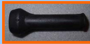
TYCO/AMP P/N 880810-1

OPTIONAL 2 POS RUBBER BOOT FITS BOTH PLUGS AND CAPS