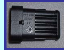
TYCO/AMP P/N 282106-1

*** WIRE SEAL IS REQUIRED FOR ALL CONFIGURATIONS *** RECEPTACLE CONTACT AND WIRE SEAL SELECTION FOR P/N 282088-1