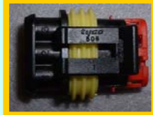
TYCO/AMP P/N 282087-1